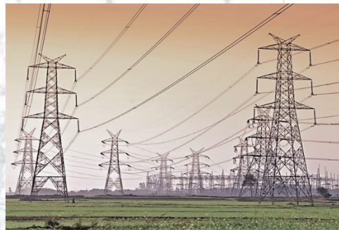
Transmission & Distribution