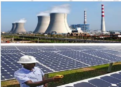
Generation & Maintenance