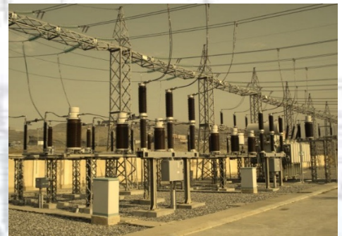
Substation Erection & Testing